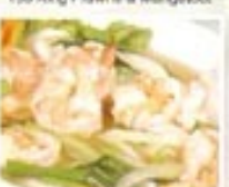
145 King Prawns with Ginger & Spring Onions