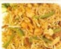
57 Singapore Fried Rice Noodles