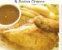
166 Roast Chicken in Barbecued Sauce