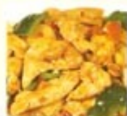
84 Chicken Szechwan Style