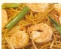
49 King Prawn Chow Mein