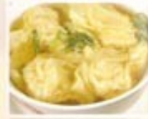
33 Won Ton Soup