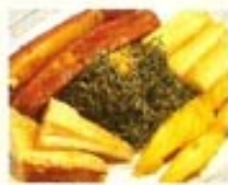
1 Chef's Hors D'oeuvres