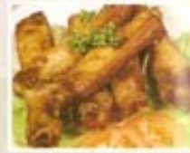
20 Peking Spare Ribs