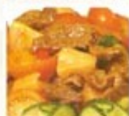
92 Beef & Tomatoes