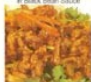
101 Crispy Shredded Beef