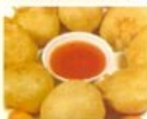
60 Sweet & Sour Chicken Balls