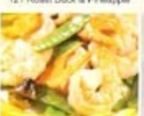
138 King Prawns & Mangelout