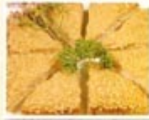
8 Sesame Prawn on Toast