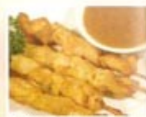
11 Satay Chicken on Skewers