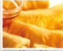
9 Pancake Roll