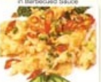
163 Spicy Squid