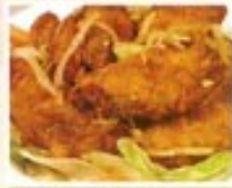
5 Spicy Chicken Wings