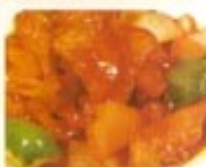
64 Sweet & Sour Pork Hawaiian Style