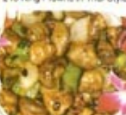
232 Mushroom Szechwan Style