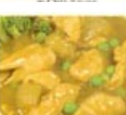
166 Chicken Curry