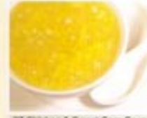
27 Chicken & Sweet Corn Soup