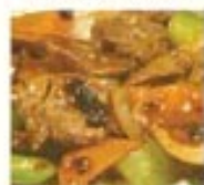
97 Beef & Green Peppers in Black Bean Sauce