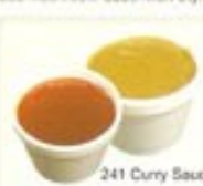
241 Curry Sauce