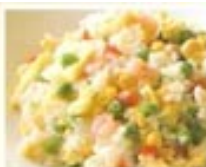
37 Young Chow Fried Rice