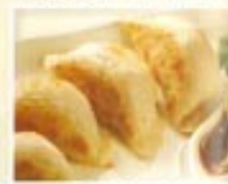
15 Peking Dumplings