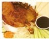
2 Crispy Peking Duck