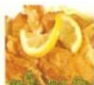
83 Lemon Chicken